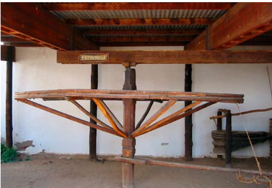
An old horse-mill at the Transgariiep Museum, still used during the annual Witblits Festival

of the finest buildings in South Africa. As the community at Philippolis grew, two wings were later added to the building.