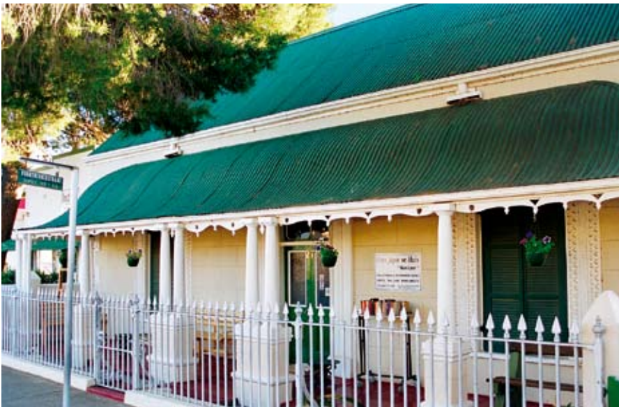
Oom Japie's House, home to a second-hand bookshop and the tourist hub of the village