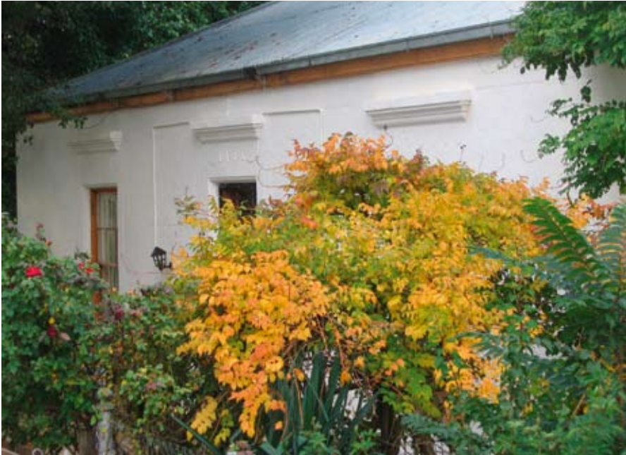
Notes written by Emily Hobbouse about her stay in Philippolis were found at this house