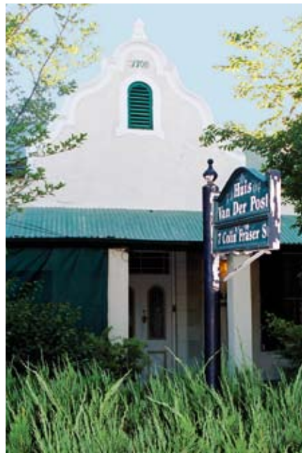
Famous author Sir Laurens van der Post (a book cover shown far left) was born in the house at 7 Colin Fraser Street (left)

even stories that Sir Harry threatened to have Adam Kok hanged if Kok did not accede to his demands. But Adam Kok II was an obstinate character and it was only death (natural) that removed him as an obstacle to Sir Harry. Unable to withstand the pressure exerted on him by Sir Harry, Adam Kok III (successor to Adam Kok II) eventually capitulated. In 1861–2, three thousand Griquas began their exodus to Niemandsland (“no-man’s-land”, later called Griqualand East) with a convoy of 300 wagons and 20 000 head of cattle. In the course of 1862, Philippolis became part of the OFS.