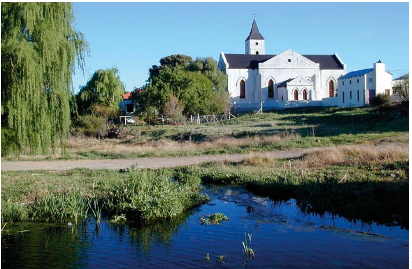
The Dutch Reformed church (1869), seen from the edge of the village. It has been described as one of the finest buildings in the country

Eventually the Griqua people suffered the same fate as the Bushmen at the hands of the Boers and the British. When Sir Harry Smith landed at the Cape his mission was to colonise as much of South Africa as possible. To this end he tried to broker a settlement by offering Adam Kok a sum of £11 000 for each Griqua farm, as well as an “allowance” of £300 per year for the rest of Adam Kok’s life. There are